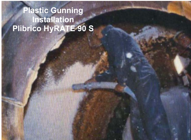
Plastic Gunning Installation Plibrico HyRATE 90 S