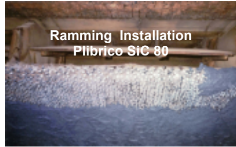
Ramming Installation Plibrico SiC 80