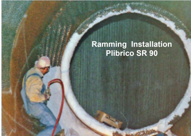
Ramming Installation Plibrico SR 90